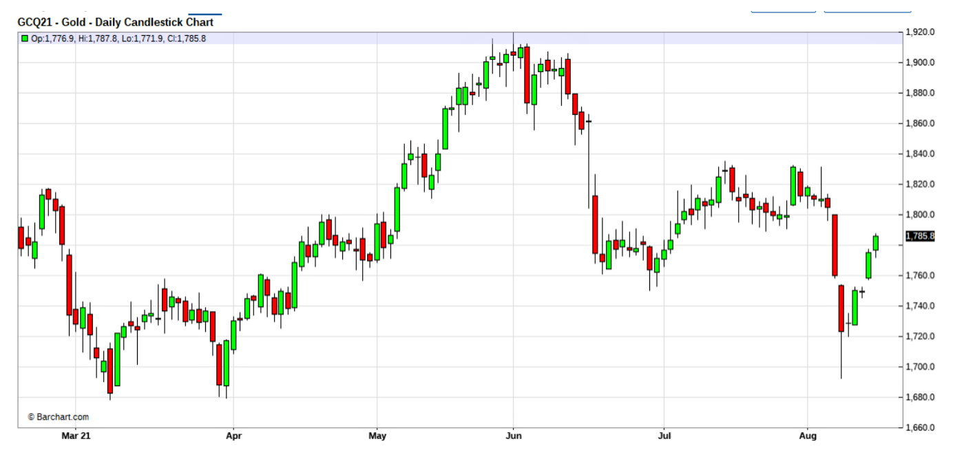
Pretty much all the gold stocks are good buys on our list, but remember to keep good cash levels, September/October are not far away.

All along I have said this whole Covid-19 fiasco will all play out in courts in the next months and years and the lies will be uncovered. Here is another new example, where 1,200 first responders in Hawaii are starting a class action lawsuit to stop a vaccine mandate. There is a longer video with the lawyer leading this suit and he goes into a lot of detail on the vaccines. There is a pretty emotional and down to earth revelation by one of the first responders, a fire captain of 20 years who has responded to many Covid-19 related emergency calls.